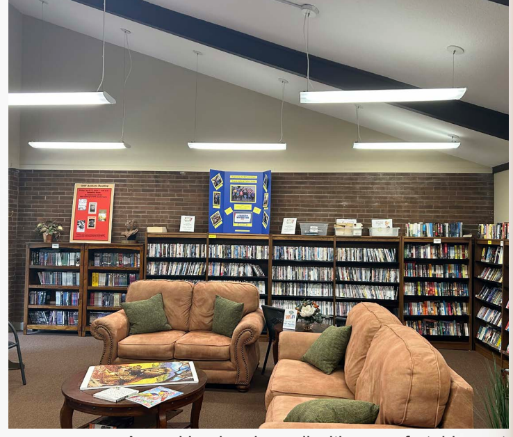
A good book pairs well with a comfortable seat