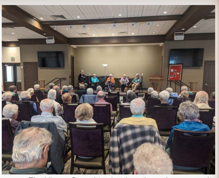
The Library Committee involves the entire community

The earnest and humble beginnings gained momentum, including in 1980 with an active Library Committee, in 1982 the Residents Council started funding, and 2011 saw the expansion to the current three rooms. In 2017, the Library Committee implemented a computer program to manage the cataloging and circulation. The Residents Council provided financial support for many years, but when Givens Communities obtained Givens Highland Farms it started funding the library and other resident activities. In 2020, a Library Management Team was installed to replace the original Library Committee. More recent efforts include the Library2Go project, with resident volunteers taking carts of books and magazines to residents of the Givens Highland Farms Health Care Center and Prentice Lodge.